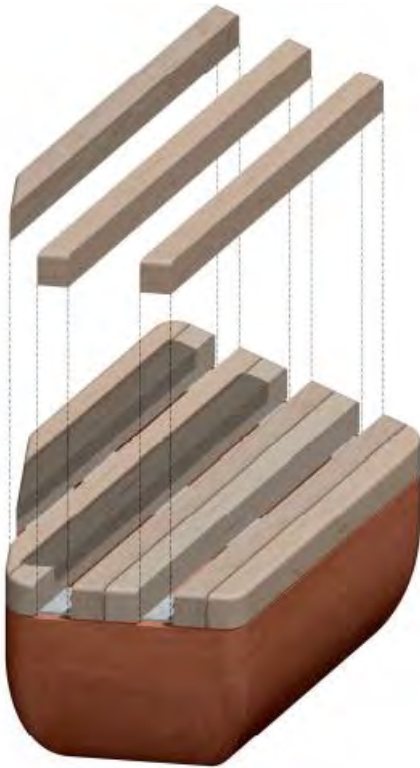
Terracotta base with timber seat