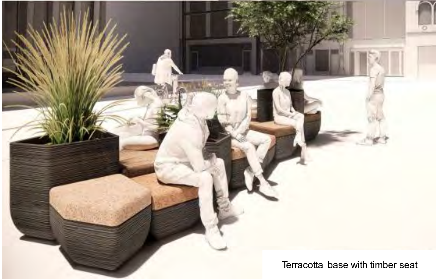
Terracotta base with timber seat